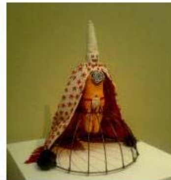
Cecilia Kane's 'The Spinmeister' is a sparkling and contradictory effigy of fast-talking leadership and its spindly underpinnings.

In an exhibition with more nuance and range than first evident, you'll find a thoughtful, witty and provocative look at what catches the contemporary eye. The show itself is our lesson — explore beyond the sparkling surface.