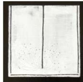
Judy Parady's cosmic imagery shimmers with subtle brushwork, application of glitter and simple forms in a sophisticated statement on the beauty of creation.