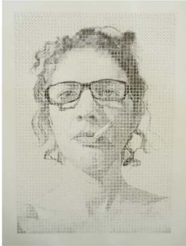
In 'Self Portrait à la Chuck Close,' Jena Sibille effectively uses the grid structure of artist Chuck Close.