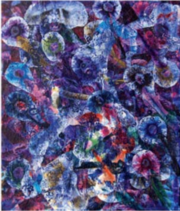
Valley and Cloud (1998) Mixed media, 77 x 66 inches

In the late 1980s, Creecy embarked on a new direction, as curvy, all-over patterning emerged in a connective and fluid structure. This was a changing voice – more lyrical, more streamlined, but no less expressive. Its visual ambiguity was purposeful, fertile, and referential. Circular shapes rippled through these compositions, teeming like mouths and beaks, eyes and heads, cells and blossoms.