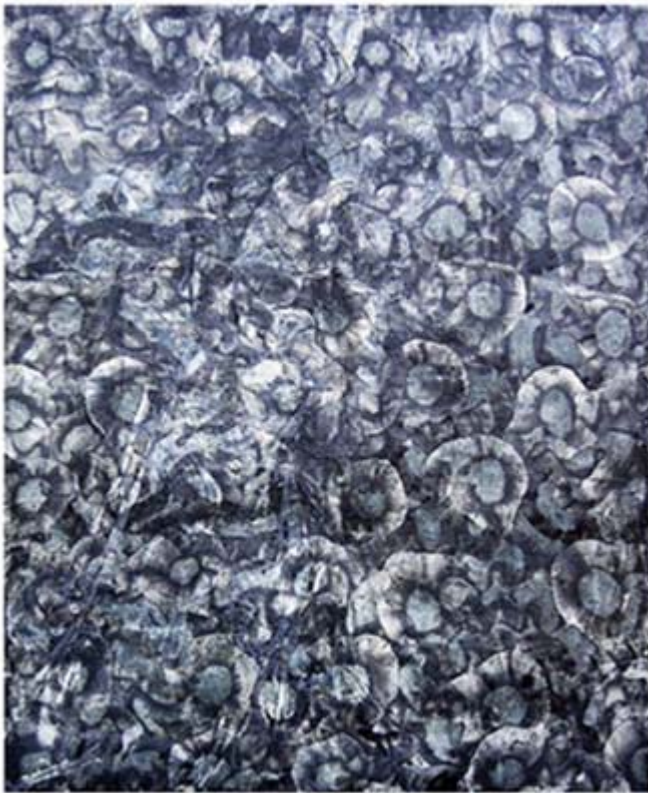
Untitled (1999) Mixed media, 90 x 72 ¾ inches

Evoking a dramatically different mood, an eerie and elegant painting from 1999, also untitled, conjures a geological formation. Creecy's pocked and liquid circles blend with subtle linear elements in what appears as an exquisite exercise in slow motion. Charcoal and gray predominate, flecked with mossy tones and red. There is no exuberance here; rather, there is weight – archaeological, atmospheric, and psychological – yet another example of the artist's versatility.