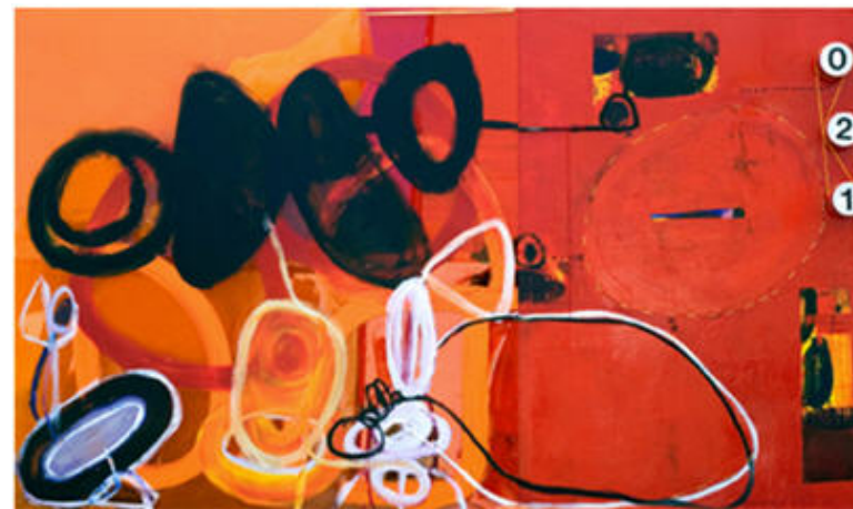
21 Ways (Mixed Media on Canvas)

To learn more about upcoming shows and available work, visit www.anthonyliggins.com .